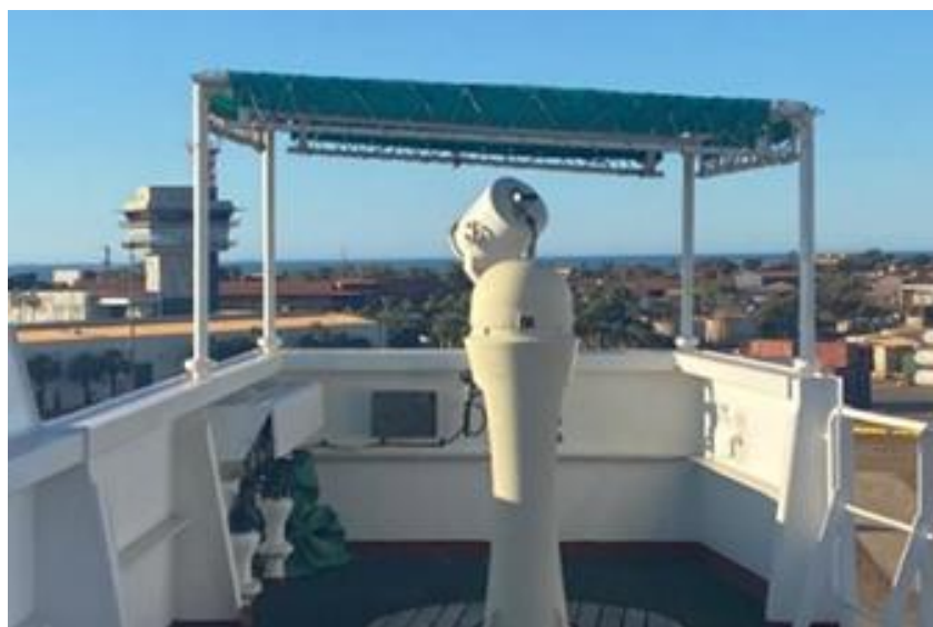
Example: Photos of Bridge Wing Shelter

All current local Marine Notices are available on our website: http://www.pilbaraports.com.au/#marine-notices