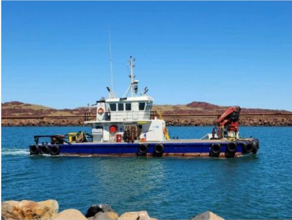
Figure 2: Workboat Arabella