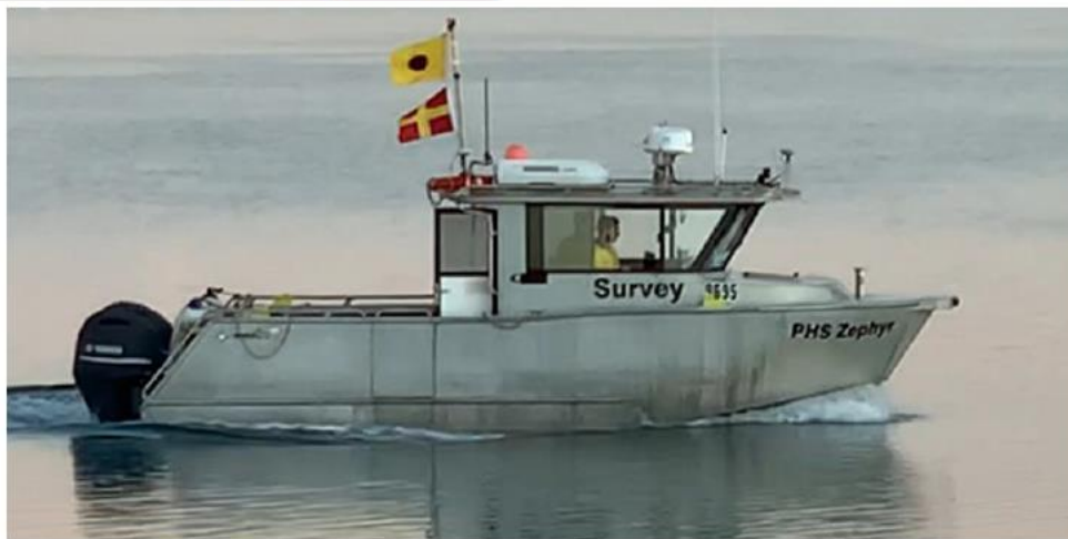
Survey Vessel Zephyr 7.9 m length x 2.7 m beam, 0.8 m draft