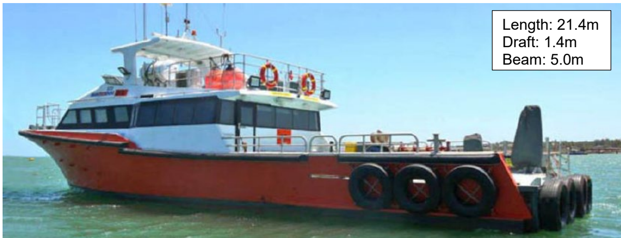
Figure 2: Survey vessel Red Dog