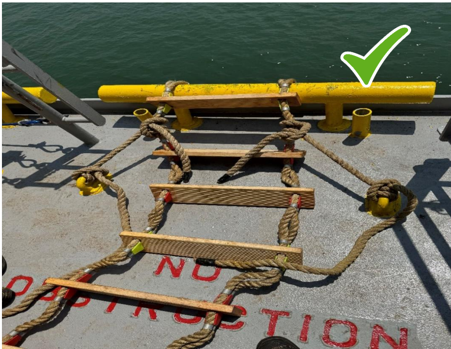
Example of correct securing of pilot ladder at intermittent Draft

It is suggested that two strong (at least 2 x 24 kN) manila ropes be used to secure the pilot ladder. Securing lines must be replaced at 12 months interval.