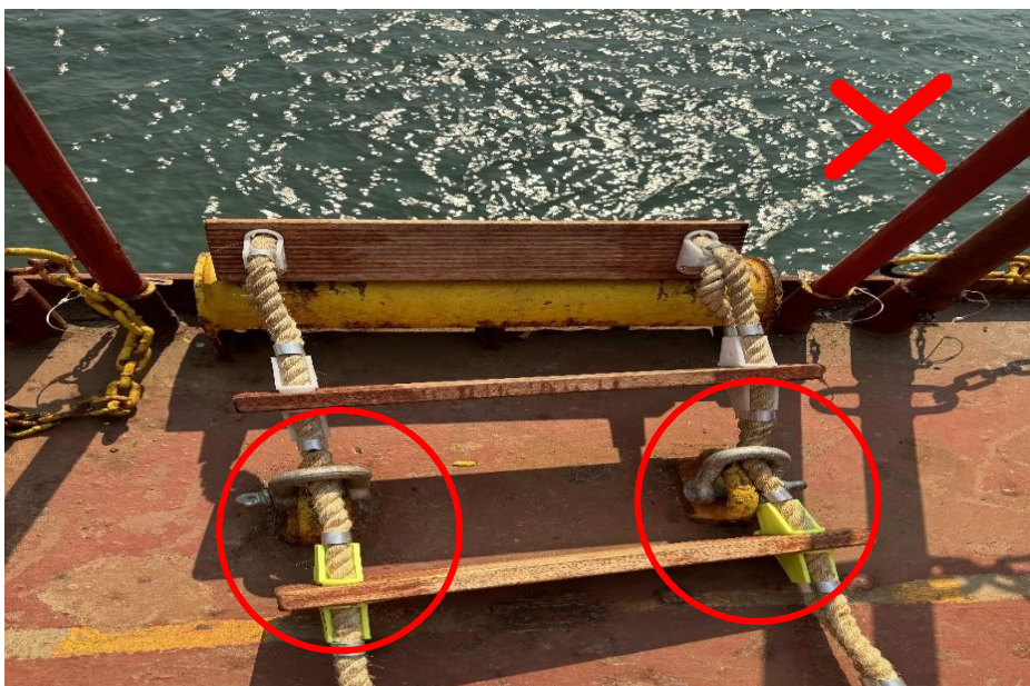
Example of incorrect securing of pilot ladder at intermediate draft